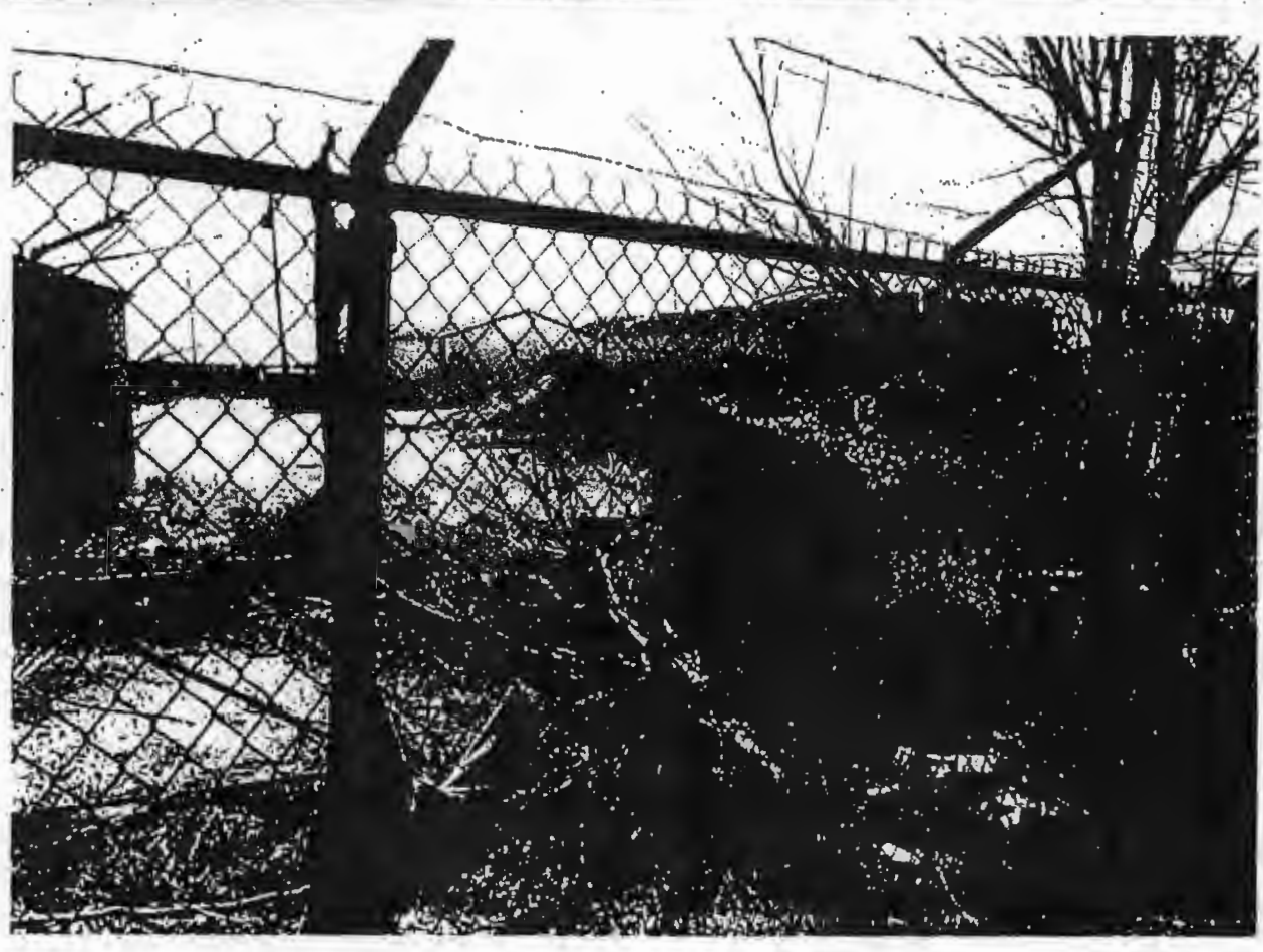
10L 6 1 PAGE 066